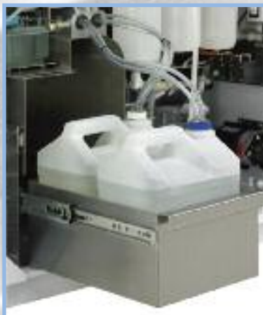
Convenient pull-out drawer holds disinfectant