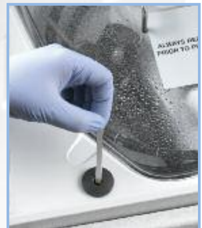
Easy testing of high-level disinfectant concentration